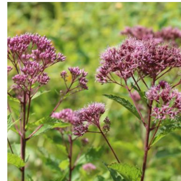
Joe Pye Weed