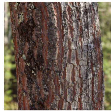
Red Oak Tree