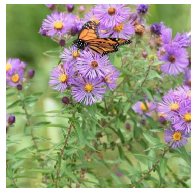
New England Aster